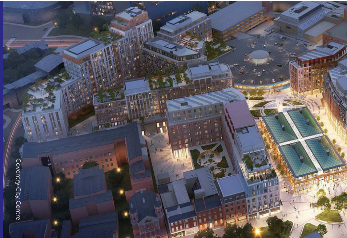
Coventry City Centre