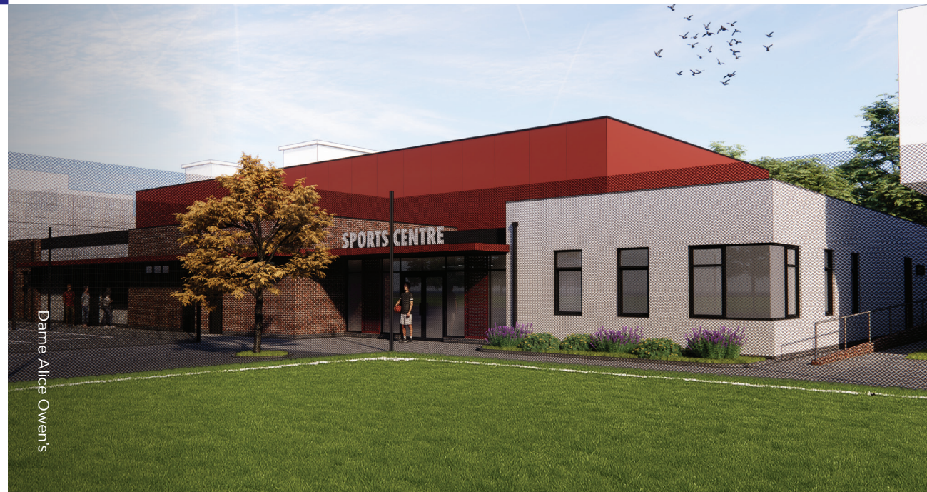
Dame Alice Owen's