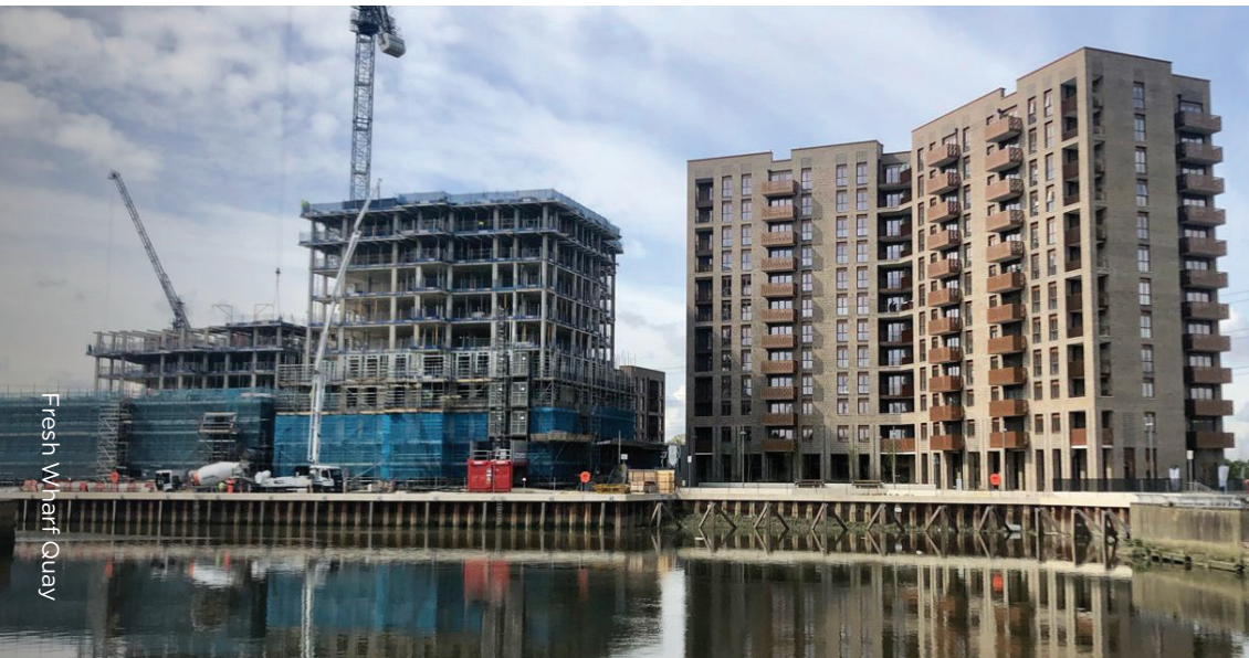
Fresh Wharf Quay

Barker builds futures that matter by creating trusted partnerships and applying innovation, sustainability, and pride to our integrated property consultancy services.